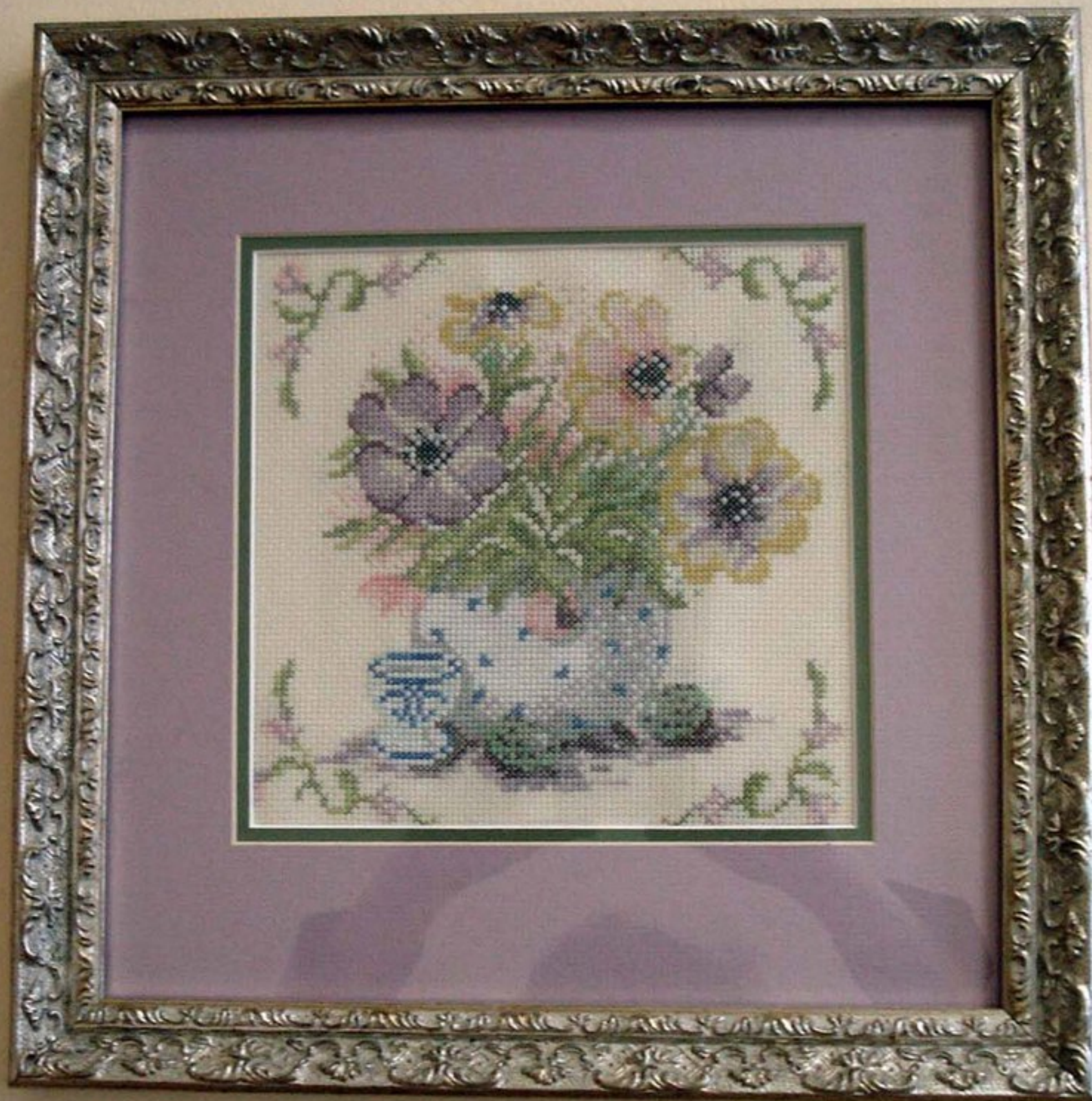
Lanarte 34230 - Anemones (Анемоны)